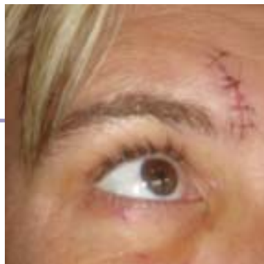
5 DAYS LATER