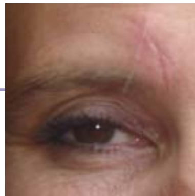
20 DAYS LATER

why many people receive compliments about the glow and vibrancy of their skin.